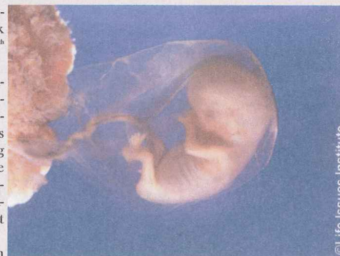
A baby of eight weeks gestation, a month younger than the typical age for abortion